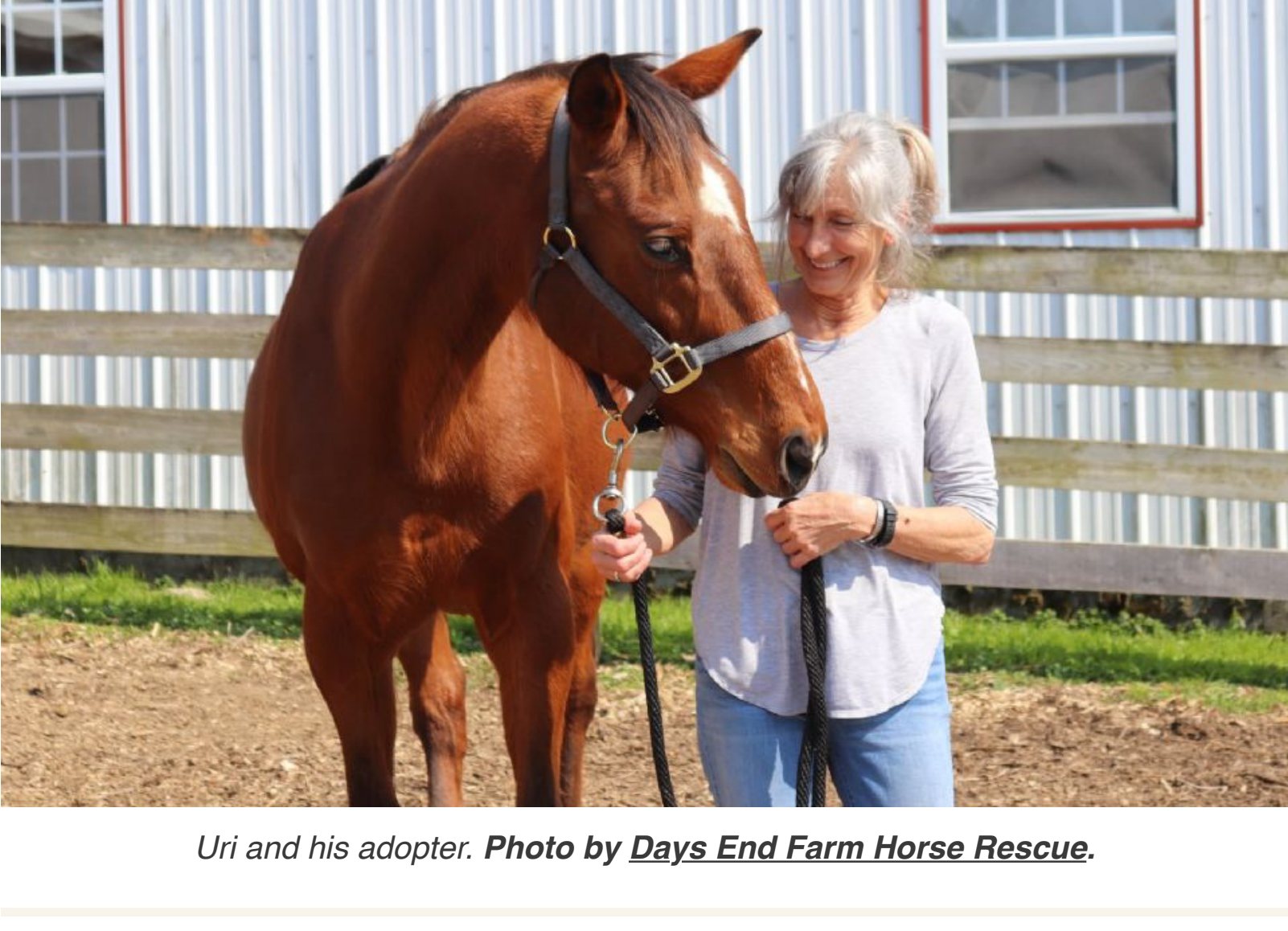
Uri and his adopter.

Over the past month, a number of horses, including Uri and Zola, have been adopted into new, loving homes. Uri is an OTTB gelding that had over 88 starts in his seven-year racing career, earning more than $57,000. Zola is a Morgan-cross filly that we have enjoyed watching grow throughout her first year of life. Congratulations!