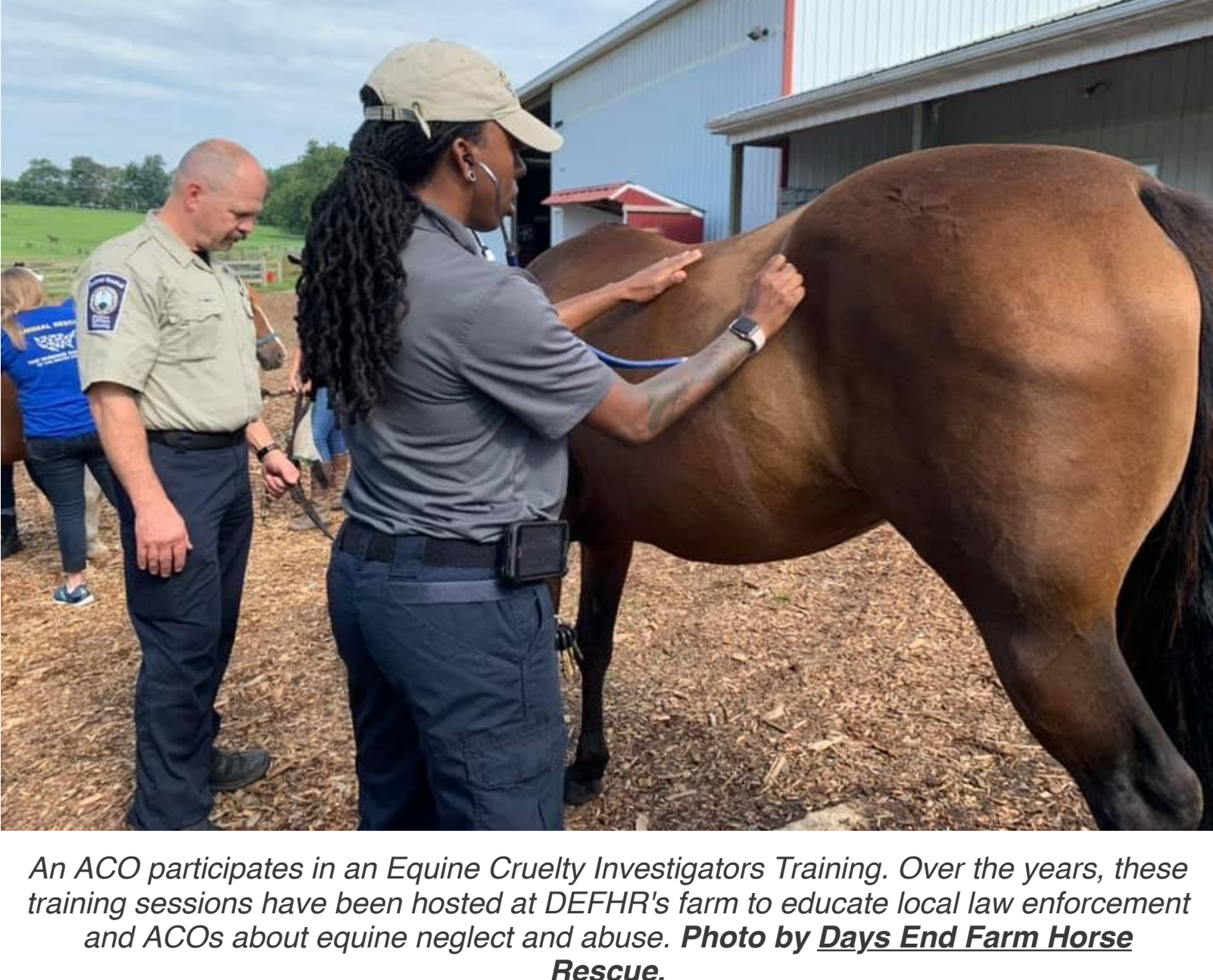
An ACO participates in an Equine Cruelty Investigators Training. Over the years, these training sessions have been hosted at DEFHR's farm to educate local law enforcement and ACOs about equine neglect and abuse.

Last week, April 12-16, was Animal Care and Control Appreciation Week and we extended our deepest gratitude to each and every Animal Control Officer (ACO) for their service and commitment to animal welfare. In DEFHR's 30-plus year history, we have been honored to work alongside hundreds of ACOs and witness their selfless acts of service to animals in need. They are the voice of justice and provide suffering animals a voice in court and they are the catalysts for change having dedicated their careers to making the world a better place.